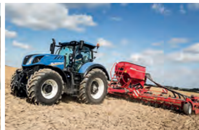
Deep or shallow cultivation