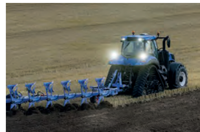
Heavy draft (ploughing)